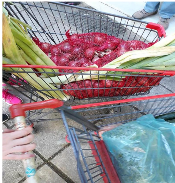
Fig. 1: This picture depicts some of the surplus gathered in our supermarket carts, including onions and leeks.

The “Boroume” (Μπορούμε “We can”) project involves volunteers visiting the Farmers’ Market at the end of their day, aiming to collect unsold products that are not needed by the producers, who are willing to donate them. Such products mainly include food provisions, from lettuce and zucchinis to eggs and fish. Having collected the necessary supplies we transfer them to specially designed areas from which they eventually end up at numerous organizations, such as orphanages, aid institutions, and rest homes. Particularly, under the program in Ano Toumpa, we have the opportunity to witness the tangible results of our voluntary work, as we ourselves transfer the supplies to the soup kitchen of the local parish. As a result, we had the chance to see and experience the gratitude of the interested parties. I am inclined to believe that the Boroume at the Farmers’ Market Program is a highly important and interesting initiative, as it focuses mainly on the appropriate use of all land resources, expanding at the same time its reach to cater to our fellow human beings, especially those in need. Through this contact with products of the earth and their importance for human beings, I was also given the opportunity to experience myself the ideas and feelings described in a number of the texts analyzed in class belonging to the genre of environmental literature.