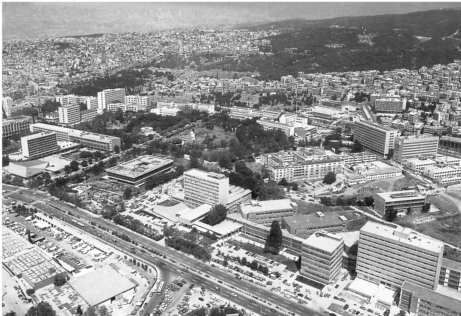
The Aristotle University Campus in Thessaloniki

Η Πανεπιστημιούπολη του Αριστοτελείου στη Θεσσαλονίκη